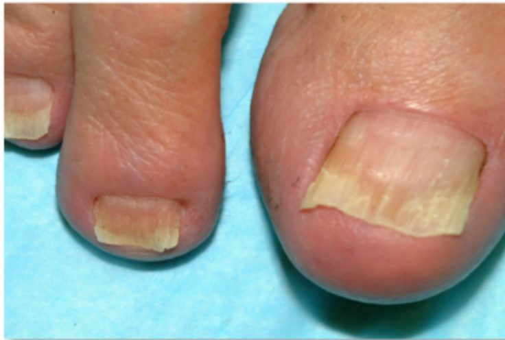
Fig 1: Toe onychomycosis: Mild - distal-lateral subungual